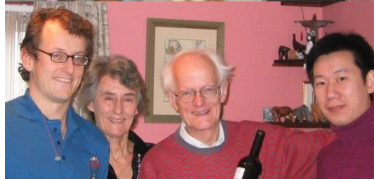
top: 2014 in Beijing; above: 2004 in Abingdon